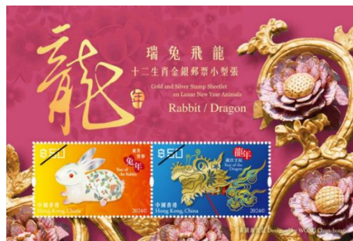
Gold and Silver Stamp Sheetlet on Lunar New Year Animals – Rabbit/ Dragon