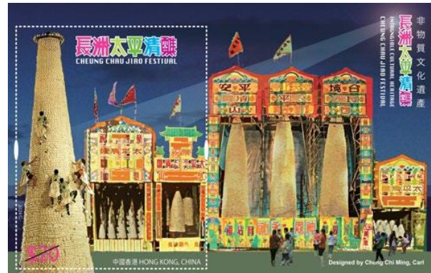
Intangible Cultural Heritage – Cheung Chau Jiao Festival