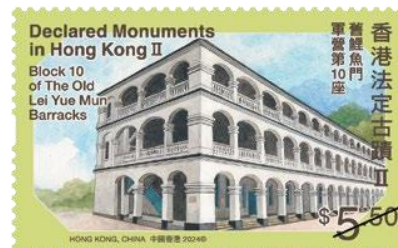
Declared Monuments in Hong Kong II

All images are for reference only. The stamp themes, issue dates, product types, prices of stamps/ stamp products, stamp designs and formats are subject to change, which will be announced prior to the launch of respective stamp issues.