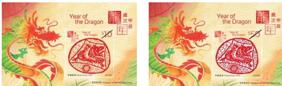
Year of the Dragon