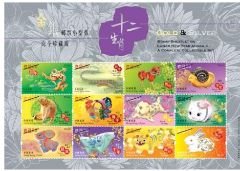
Gold and Silver Stamp Sheetlet on Lunar New Year Animals – A Complete Collectible Set