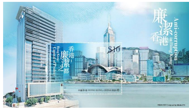
Anti-corruption in Hong Kong