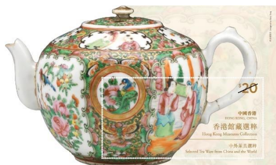
Hong Kong Museums Collection – Selected Tea Ware from China and the World