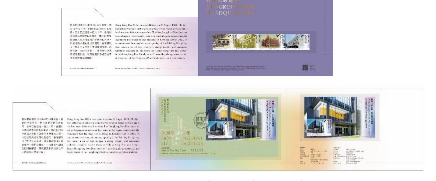
Presentation Pack (Prestige Version) (Inside)