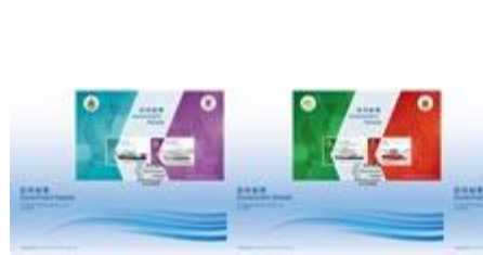
A set of 3 Serviced First Day Covers affixed with stamp sheetlets from the Prestige Stamp Booklet and date-stamped with the special postmark