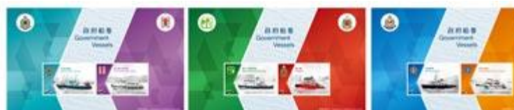
3 Stamp Sheetlets in Prestige Stamp Booklet