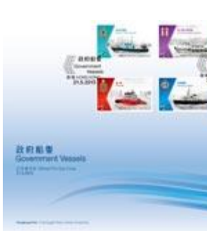
Serviced First Day Cover affixed with a set of 6 stamps and date-stamped with the special postmark