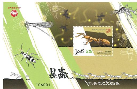
Stamp Sheetlet (MA687) $20.00