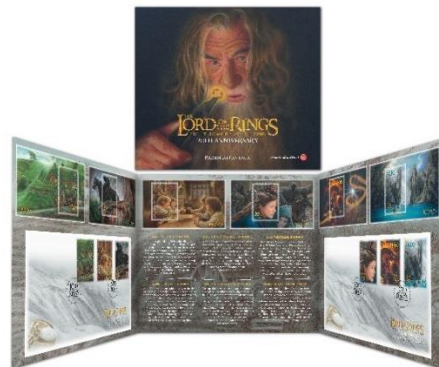
Presentation Pack (NZ329) $240.00