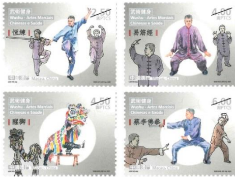
Set of 4 Stamps (MA684) $20.00