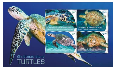
Souvenir Sheet (AU512) $50.00