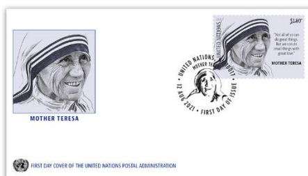
Served First Day Cover with Stamp (UN125) $25.00