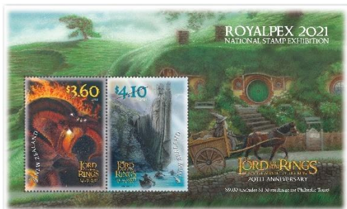
Souvenir Sheet (NZ331) $65.00