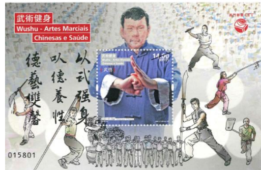
Stamp Sheetlet (MA685) $20.00