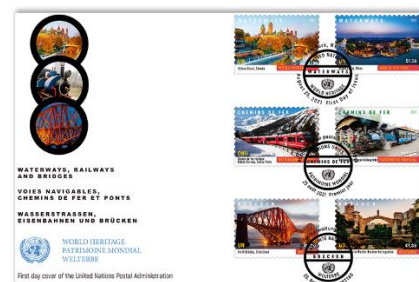
Served First Day Cover with Stamp Set (UN126) $90.00