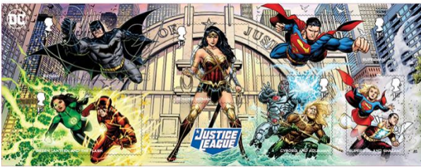
Stamp Sheetlet (BR469) $70.00