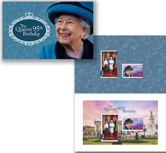
Presentation Pack (AU514) $70.00