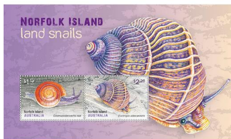
Souvenir Sheet (AU511) $25.00