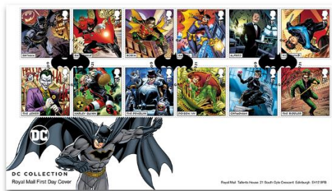
Serviced First Day Cover with Stamp Set (BR471) $170.00