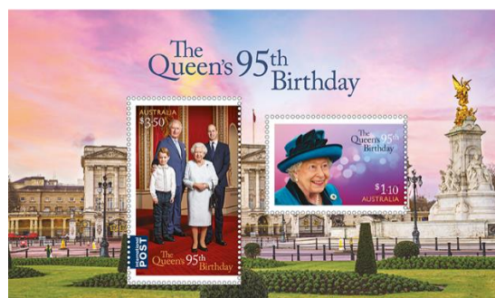
Souvenir Sheet (AU513) $35.00