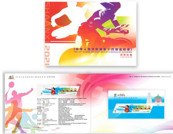
Presentation Pack (CH198) $40.00

2021 marks the 20th anniversary of the release of The Fellowship of the Ring , the first episode of The Lord of the Rings trilogy. To celebrate this special occasion, New Zealand Post issued a set of six stamps and a stamp sheetlet featuring key moments from the film with original paintings by the award-winning artist Sacha Lees.