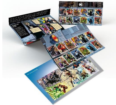
Presentation Pack (BR470) $210.00