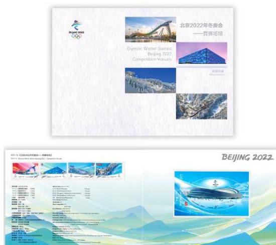
Presentation Pack (CH197)