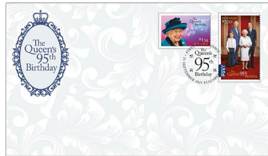
Served First Day Cover with Stamp Set (AU515) $35.00