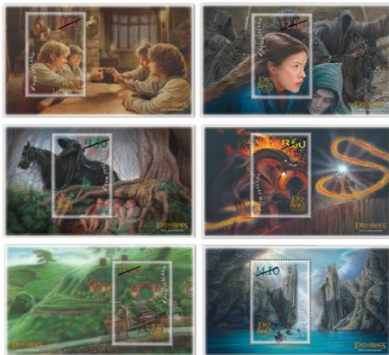
A Set of 6 Stamps Sheetlets (NZ328) $110.00