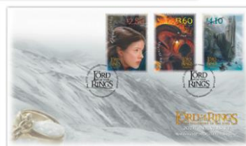
A Set of 2 Serviced First Day Cover with Stamp Set (NZ330) $110.00