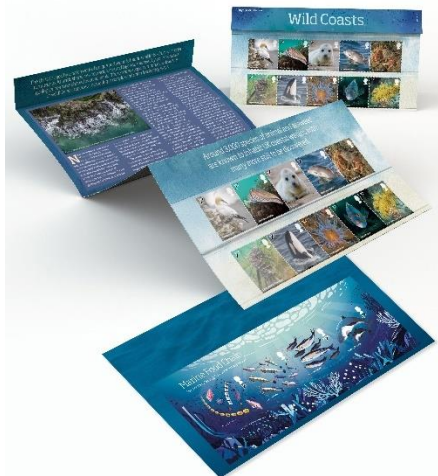
Presentation Pack (BR466) $190.00