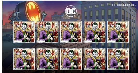
Set of 10 Stamps (The Joker) (BR468) $120.00