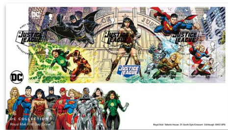
Serviced First Day Cover with Stamp Sheetlet (BR472) $90.00