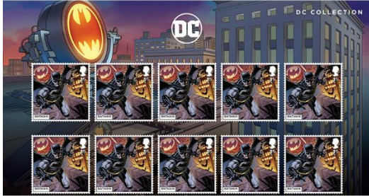
Set of 10 Stamps (Batman) (BR467) $120.00