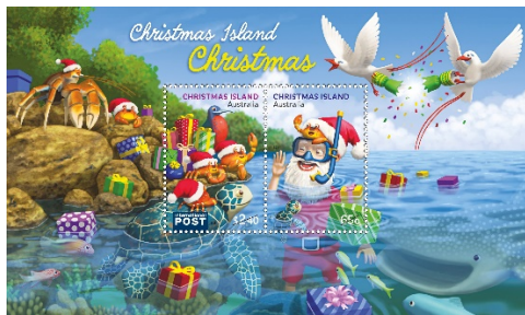
Stamp Sheetlet (AU518)