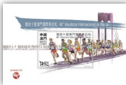
Stamp Sheetlet (MA697) $20.00

Details and selling prices of the philatelic products as well as the sales quota are as follows: