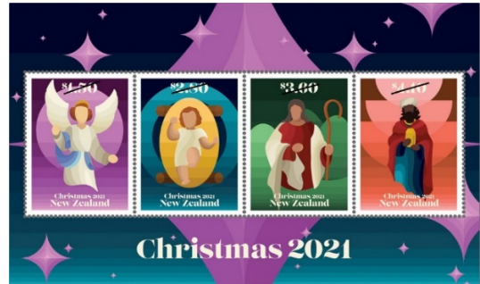
Souvenir Sheet (NZ332) $80.00