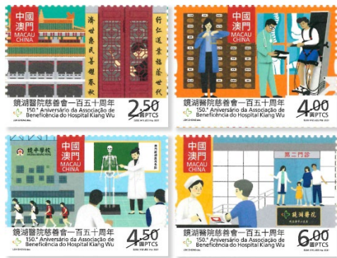
Set of 4 Stamps (MA688) $20.00