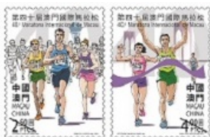
Set of 2 Stamps (MA696) $10.00