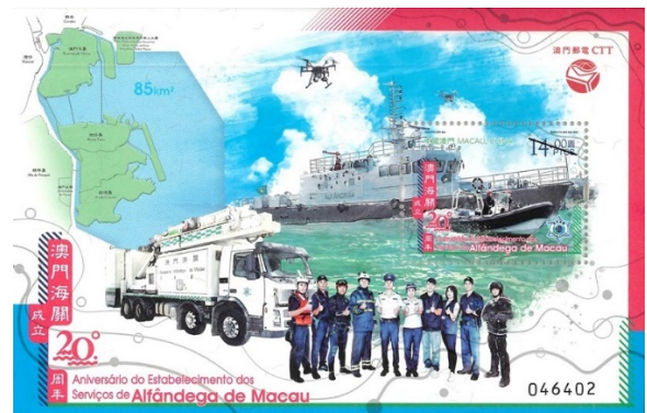
Stamp Sheetlet (MA693) $20.00