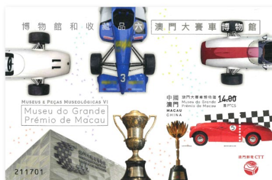
Stamp Sheetlet (MA695) $20.00