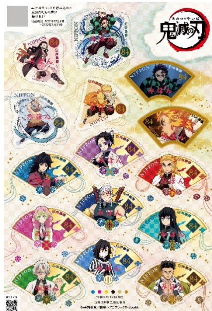
Souvenir Sheet of (Seal Type) (JP008) $110.00