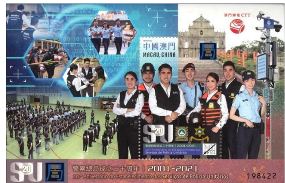
Stamp Sheetlet (MA691) $20.00