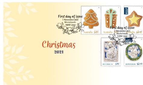
Serviced First Day Cover with Stamp Set (AU517)