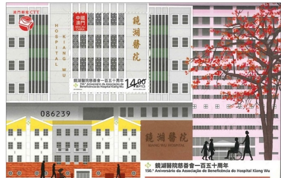
Stamp Sheetlet (MA689) $20.00