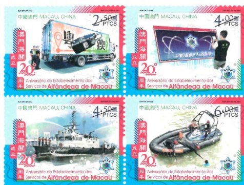
Set of 4 Stamps (MA692) $20.00