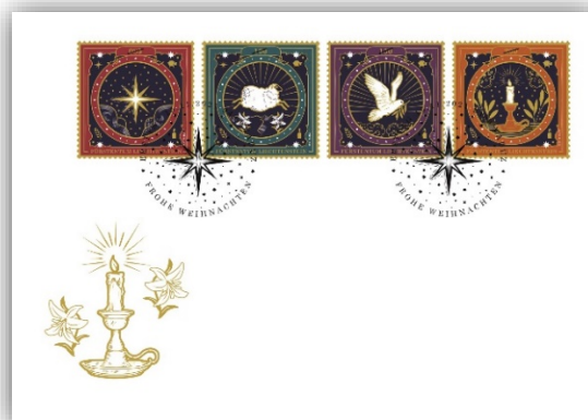
Serviced First Day Cover with Stamp Set (LI163)