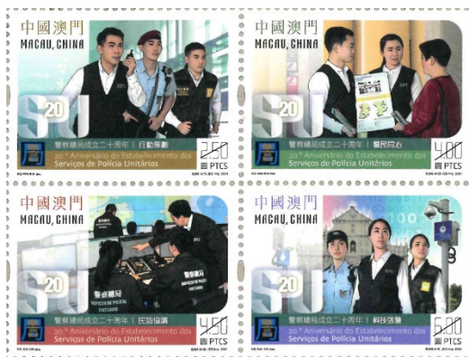
Set of 4 Stamps (MA690) $20.00