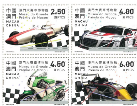
Set of 4 Stamps (MA694) $20.00