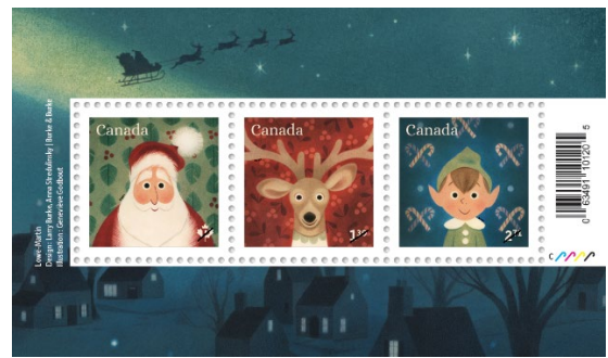
Serviced First Day Cover with Souvenir Sheet (CA281)