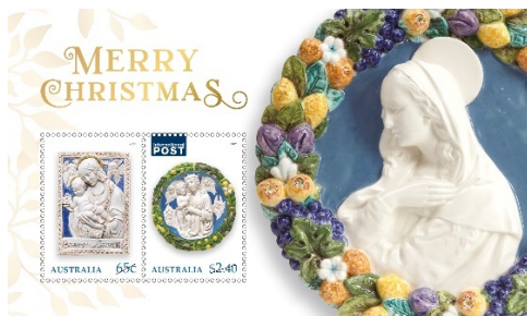
Stamp Sheetlet (AU516)