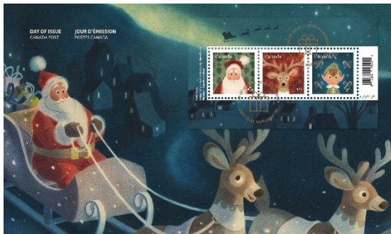
Souvenir Sheet (CA280)