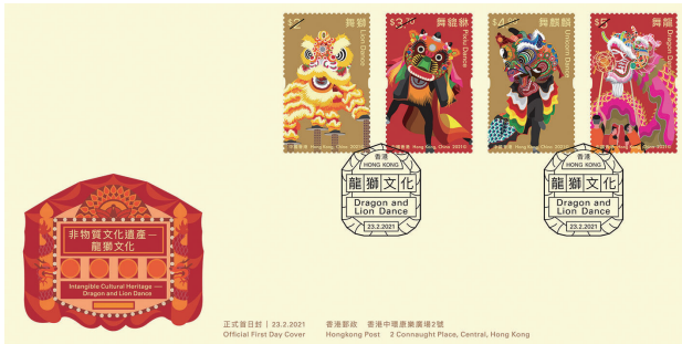
Serviced First Day Cover affixed with a set of four stamps and date-stamped with the special postmark