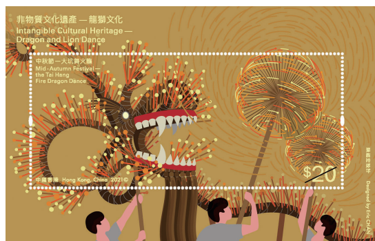
$20 Stamp Sheetlet