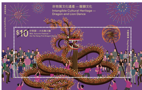
$10 Stamp Sheetlet