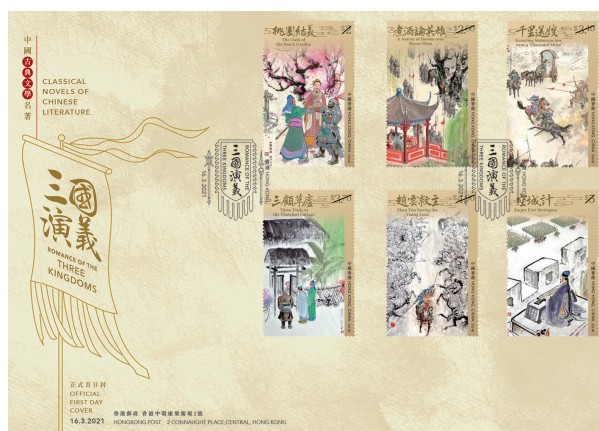
Serviced First Day Cover affixed with a Set of 6 Stamps

The design concept of the official First Day Cover is related to the flag in the battlefield which echoes with the theme “ Romance of the Three Kingdoms ”, making it a precious collectible.