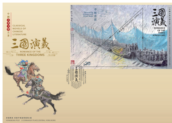
Serviced Collector Cover affixed with a $20 Stamp Sheetlet

The design concept of the official First Day Cover is related to the flag in the battlefield which echoes with the theme “ Romance of the Three Kingdoms ”, making it a precious collectible.