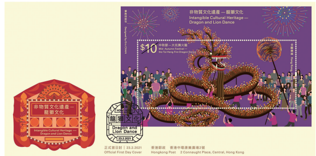
Serviced First Day Cover affixed with a $10 Stamp Sheetlet and date-stamped with the special postmark