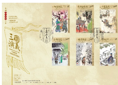
Serviced First Day Cover affixed with a Set of 6 Stamps

To allow stamp lovers to place order for their favourite products, the order deadline (for collection on issue date) is also extended as follows: