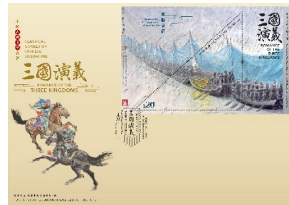
Serviced Collector Cover affixed with a $20 Stamp Sheetlet

The design concept of the First Day Cover is related to the flag in the battlefield which echoes with the theme " Romance of the Three Kingdoms ", making it a precious collectible.