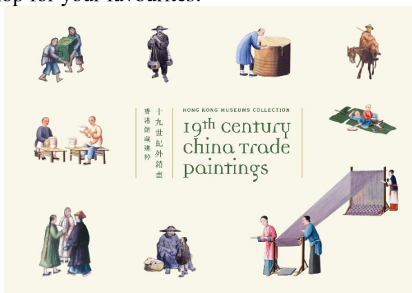
Collector Pack (Cover)

The Collector Pack includes a set of six stamps, a $10 stamp sheetlet, a $20 stamp sheetlet, a serviced first day cover and two serviced collector covers*. The eight original paintings are shown in their entirety for appreciation by stamp lovers. The first day cover and the collector covers are designed on the paintings used for three of the stamps respectively. The first day cover features the porcelain shop intricately illustrated on the pale green background, bringing a sense of freshness and elegance; the collector covers on the other hand adopts a simple style for the design. Affixed with the $20 stamp sheetlet, the collector cover embodies a strong historical ambience which helps to set off the stamps in vibrant colours. The two serviced collector covers are included exclusively in the Collector Pack and not for sales separately, making them precious collectables. Please be reminded that the deadline for order to be collected on the issue date is 13 April 2021. Seize the chance and shop for your favourites!