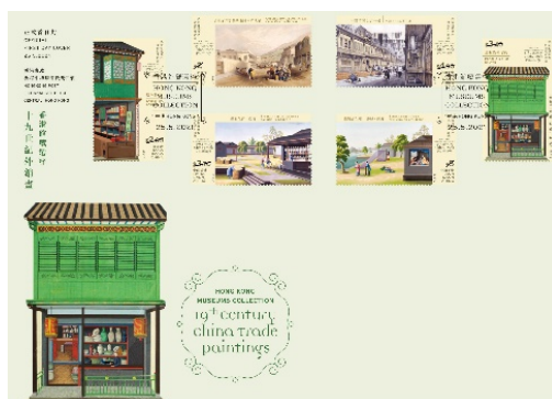
Serviced First Day Cover affixed with a set of six Stamps