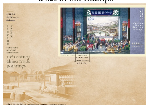
Serviced Collector Cover affixed with a $20 Stamp Sheetlet

* originally “3 dated stamped First Day Covers” Note: All images are for reference only.