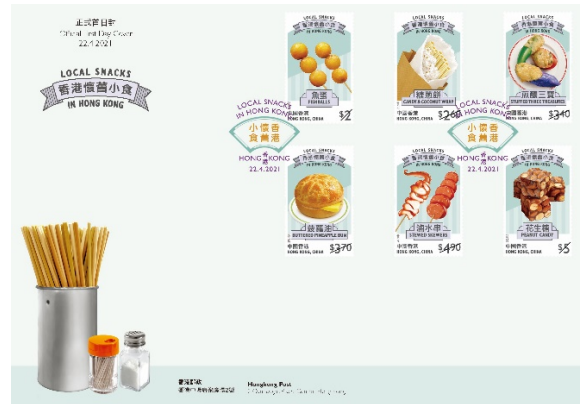
Serviced First Day Cover affixed with a set of six stamps and date-stamped with the colour postmark