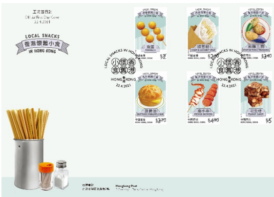
Serviced First Day Cover affixed with a set of six stamps and date-stamped with the special postmark