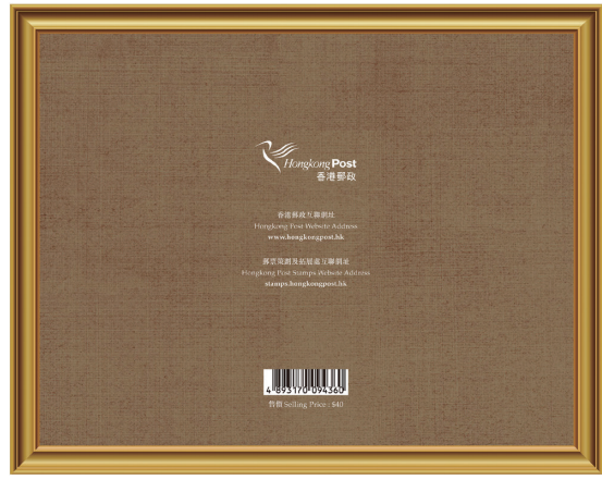
Presentation Pack (Back)