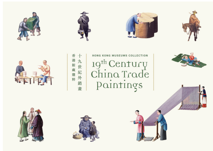
Collector Pack (Cover)