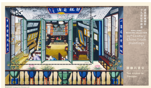
$10 Stamp Sheetlet