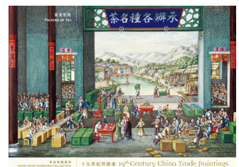
Postage Prepaid Picture Cards (Air Mail) (containing a set of eight cards)