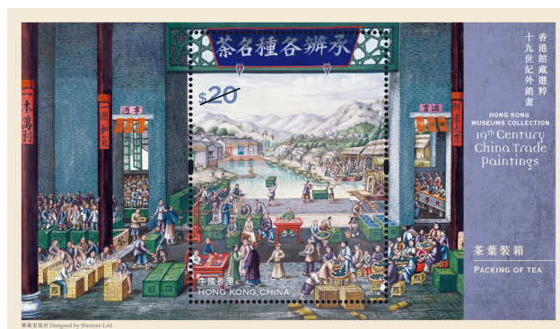
$20 Stamp Sheetlet