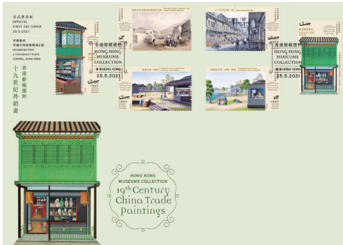
Serviced First Day Cover affixed with a set of mint stamps in six denominations (date-stamped with special postmark)