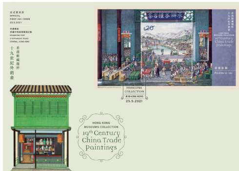
Serviced First Day Cover affixed with a $20 Stamp Sheetlet (date-stamped with special postmark)