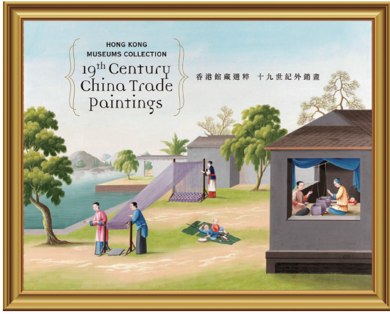
Presentation Pack (Cover)