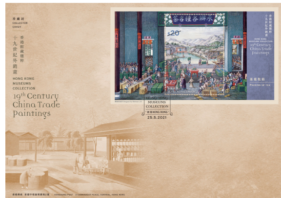
Serviced Collector Cover affixed with a $20 Stamp Sheetlet (date-stamped with special postmark)