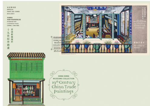
Serviced First Day Cover affixed with a $10 Stamp Sheetlet (date-stamped with special postmark)