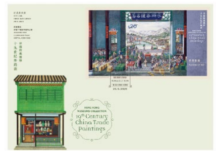
Serviced First Day Cover affixed with a $20 Stamp Sheetlet (date-stamped with the special postmark)