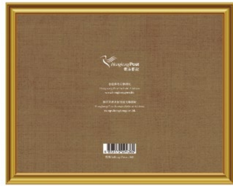
Presentation Pack (Back)