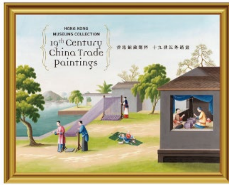
Presentation Pack (Cover)