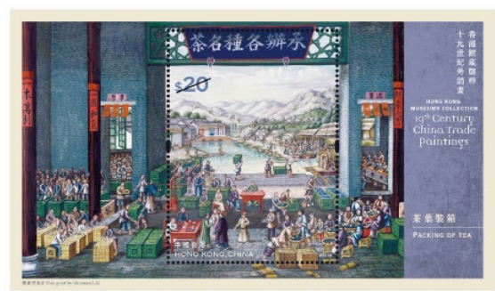
$20 Stamp Sheetlet