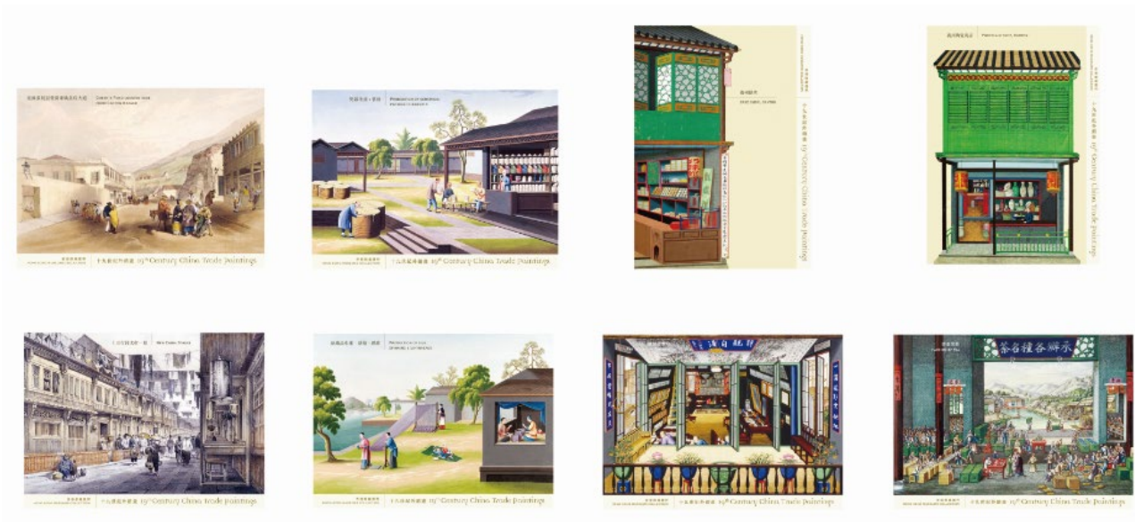
Postage Prepaid Picture Cards (Air Mail) (containing a set of eight cards)