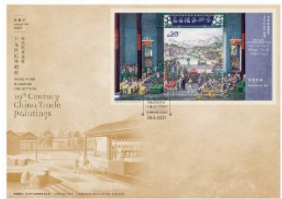
Serviced Collector Cover affixed with a $20 Stamp Sheetlet (date-stamped with special postmark)