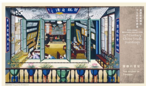
$10 Stamp Sheetlet