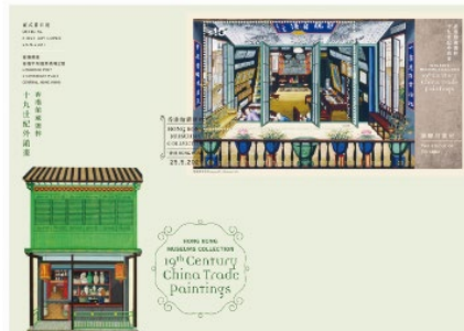
Serviced First Day Cover affixed with a $10 Stamp Sheetlet (date-stamped with special postmark)