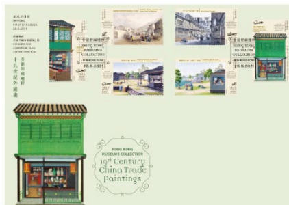
Serviced First Day Cover affixed with a set of mint stamps in six denominations (date-stamped with special postmark)