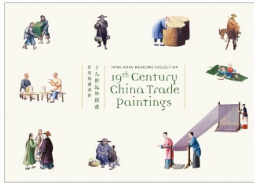
Collector Pack (Cover)