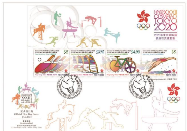
Serviced First Day Cover affixed with a Souvenir Sheet (date-stamped with special postmark)