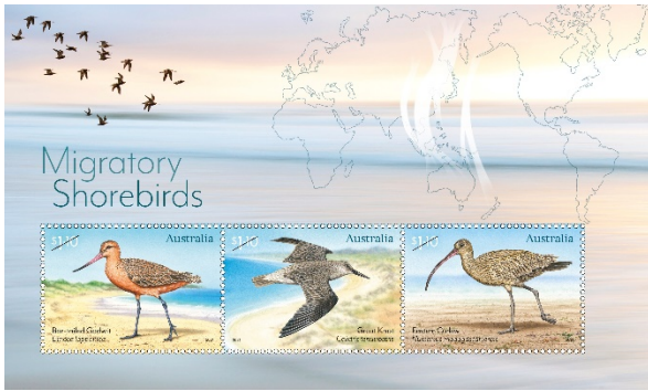
Souvenir Sheet (AU507) $25.00