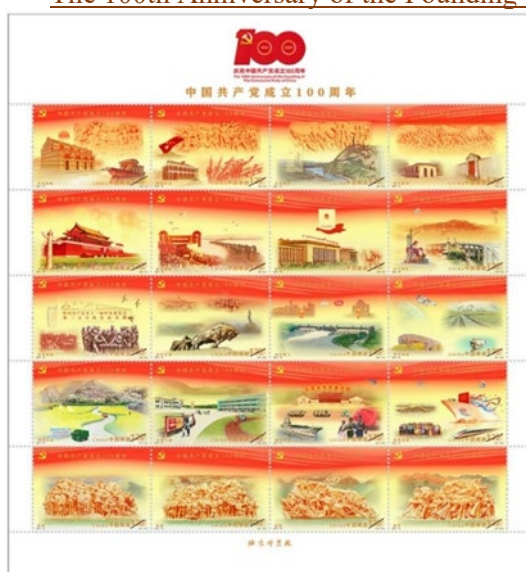
Commemorative Stamps (CH195) $50.00