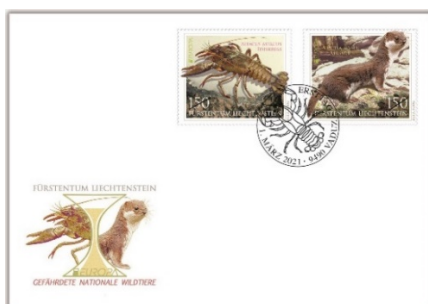
Serviced First Day Cover with Stamp Set (LI160) $45.00