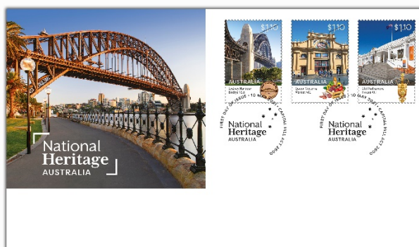
Serviced First Day Cover with Stamp Set (AU506) $30.00