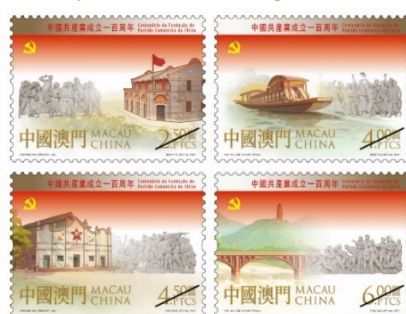
Set of 4 Stamps (MA682) $20.00