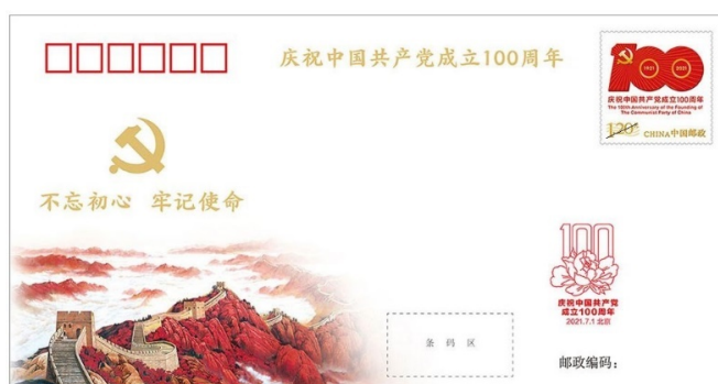
Commemorative Cover with Stamp (CH196) $10.00