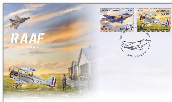
Serviced First Day Cover with Stamp Set (AU504) $35.00