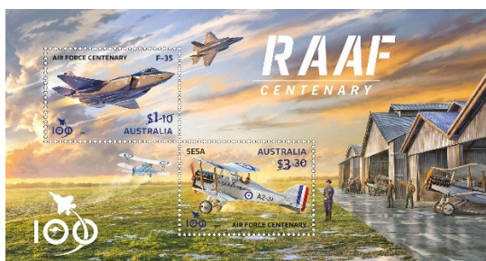
Souvenir Sheet (AU503) $35.00