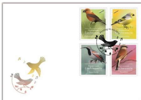
Serviced First Day Cover with Stamp Set (LI162) $70.00