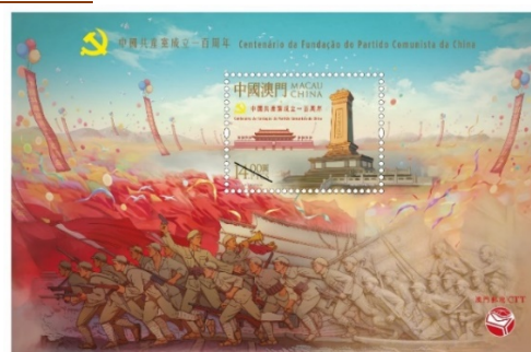
Stamp Sheetlet (MA683) $20.00