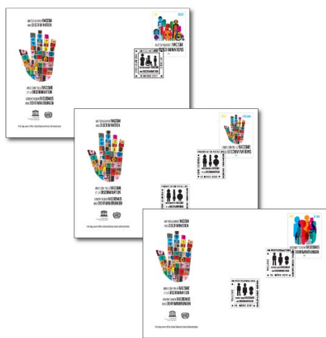
A Set of 3 Serviced First Day Covers with Stamps (UN123) $80.00