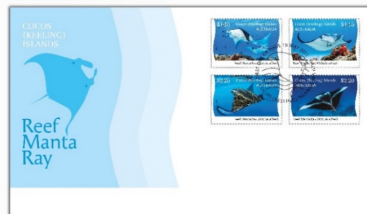
Serviced First Day Cover with Stamp Set (AU510) $50.00