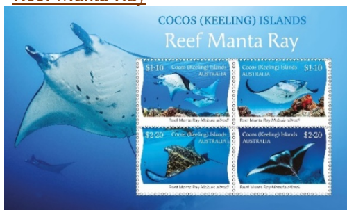
Souvenir Sheet (AU509) $50.00