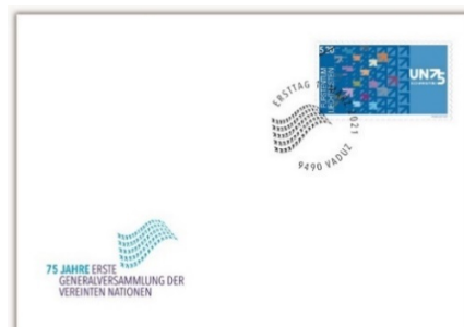
Serviced First Day Cover with Stamp (LI161) $65.00