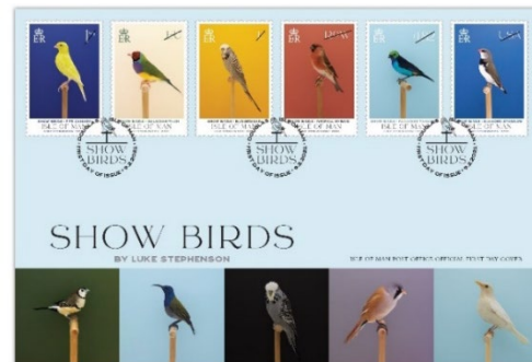
Serviced First Day Cover with Stamp Set (IM185) $120.00