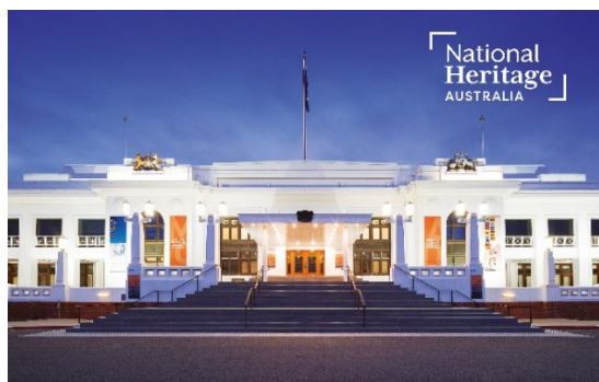
Presentation Pack (AU505) $30.00