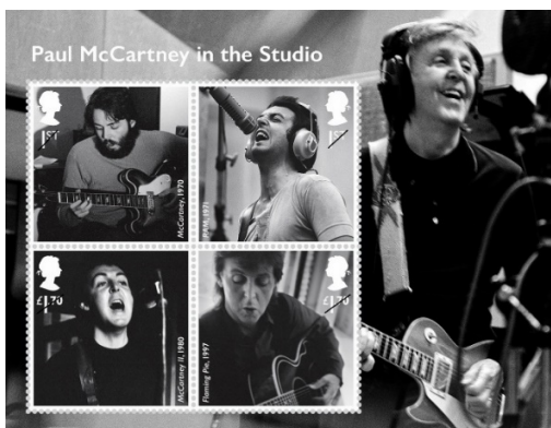
Souvenir Sheet (BR464) $70.00