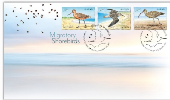
Serviced First Day Cover with Stamp Set (AU508) $30.00