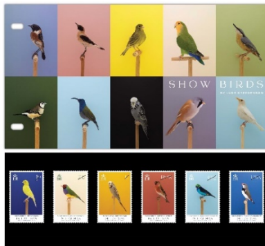
Presentation Pack (IM184) $120.00